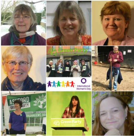
Girl Power at it's best!

In March we celebrated some of the great women who are part of our Ashford Green Party Team. From everyday activism to standing as candidates both locally and in Parliament. These are a few of the incredible women here in Ashford who use their voices to help to make the world a better place.