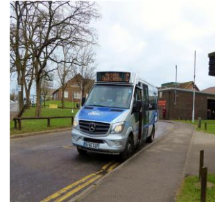
The Little & Often buses have left Ashford for good

We may have found the Little & Often buses a little cramped, but on June 3 rd Stagecoach buses imposed a savage cut to it's Ashford bus routes. Gone are the quiet and low-emission modern minibuses, instead we see the return of rattling old vehicles -all blue smoke and breakdowns – to the narrow roads of Willesborough. Worse still, Route C servicing the hospital is now on a reduced frequency. Some other Ashford routes are even being withdrawn, making it difficult to get to work in some parts of town using public transport!